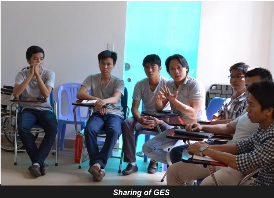
Sharing of GES