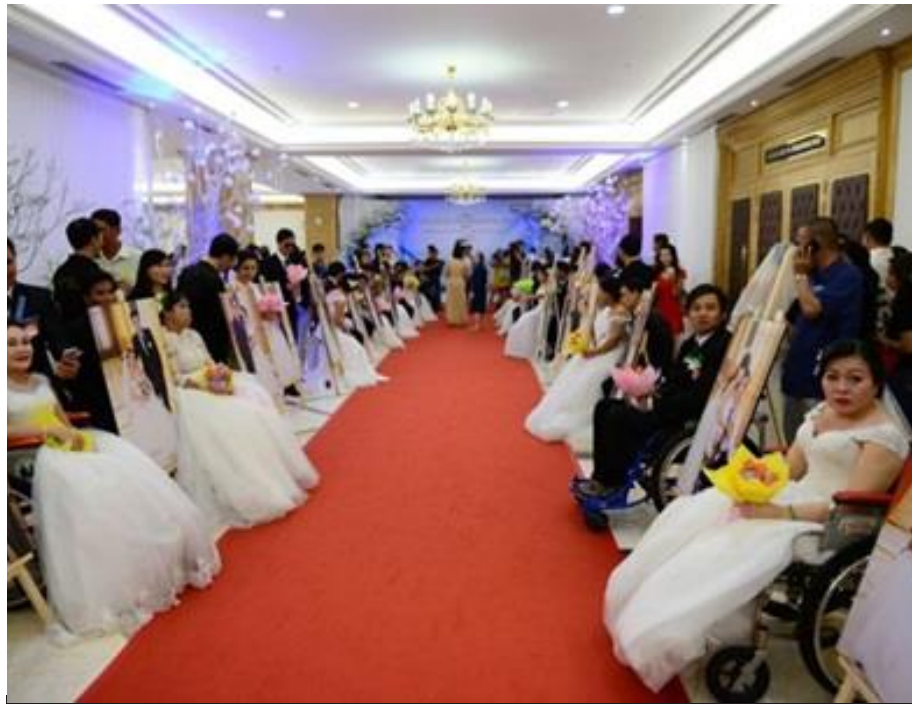
Special day: Forty couples with disabilities were married in a group wedding held in HCM City on Tuesday.